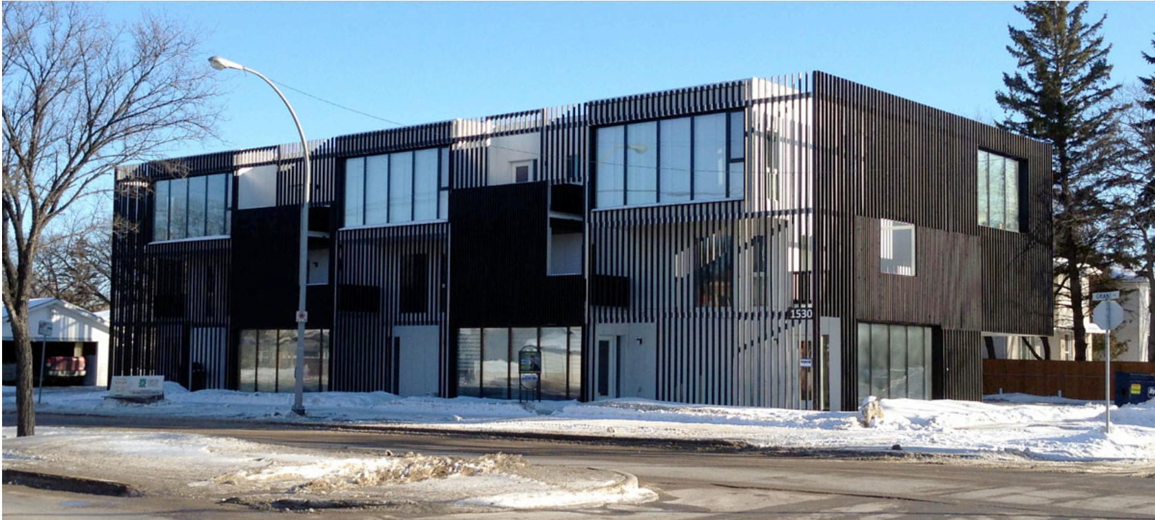
Bloc_10, 5468796 Architecture, 2010.

More recently, a new variety of brise soleil has appeared in contemporary Winnipeg architectural practice. Immovable and rendered mostly in wood, these sun-screens serve as much for privacy as for shading. Examples include the rhythmic, diaphanous veiling apparent in 5468796 Architecture's Bloc_10 condominium project (2010) and the screens of the Abbi Condominium building by architects h5.