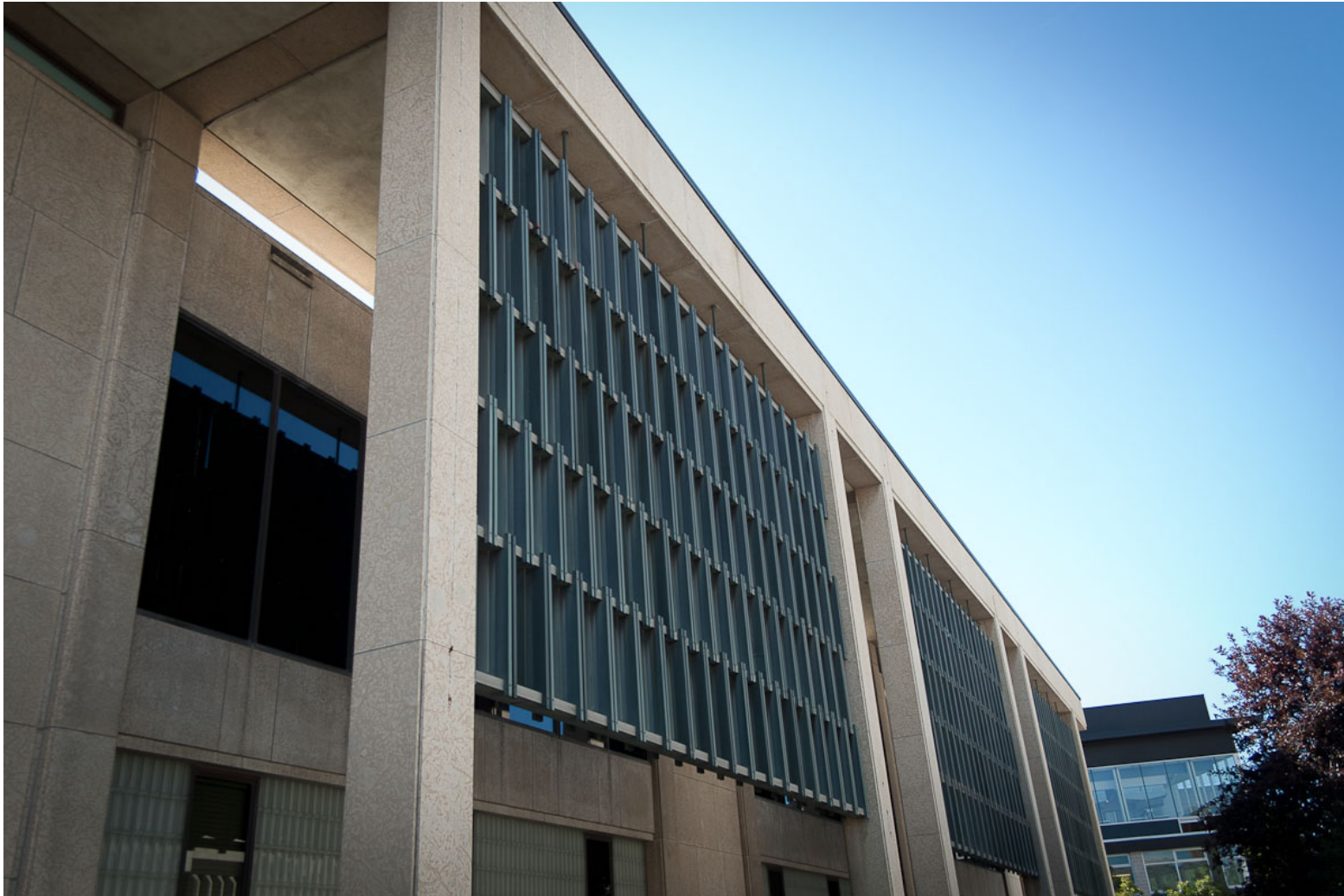
Winnipeg City Hall, Green Blankstein Russell and Associates, 1964.

Brise soleil also make an appearance in another 1964 civic building, the Winnipeg City Hall by Green Blankstein Russell and Associates (510 Main Street). Here the brise soleil take the form of six bronze screens, suspended on the matching east and west sides of the building, which have, with age, gained a dark green patina.