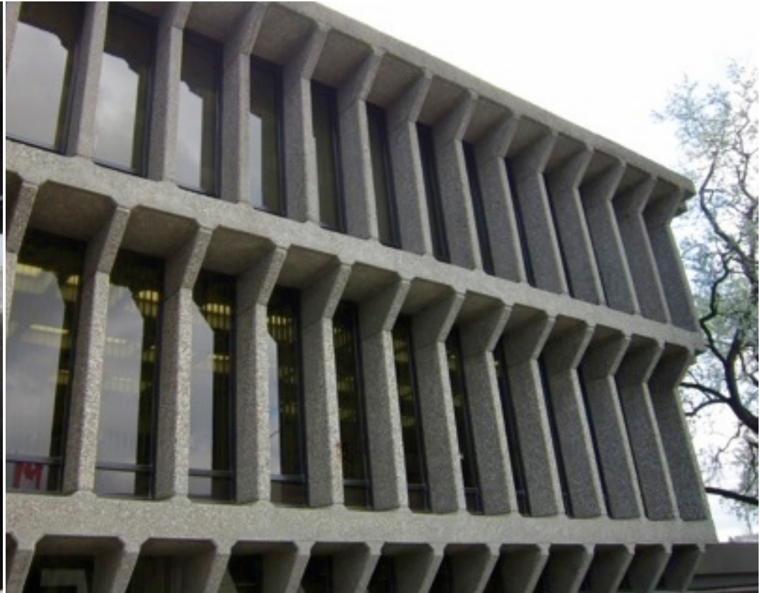
Manitoba Teachers Society Headquarters Building , Libling Michener and Associates, 1966.

Heavy mullions which assume a brise soleil type function also turn up in another Libling Michener and Associates work of the mid-1960s, the Manitoba Teachers Society Headquarters Building (191 Harcourt Street, 1966). Here the pre-cast concrete segments create a vigorous rhythm as they wrap the building's façades – in particular on the later, curving addition which fronts the south Portage Avenue elevation.