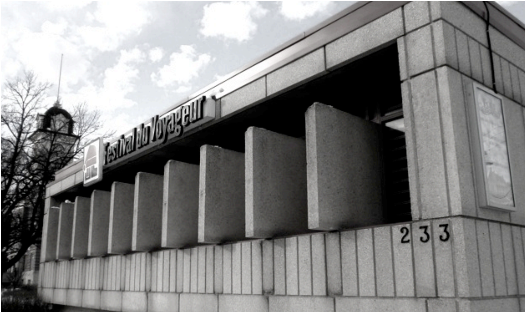
St. Boniface Police Station, County Court & Health Unit, Étienne Gaboury, 1964.

Brise soleil appear, as well, in the guise of heavy-set mullions on the southern façade of Gaboury's St. Boniface Police Station, County Court & Health Unit (227 Provencher Boulevard, 1964).