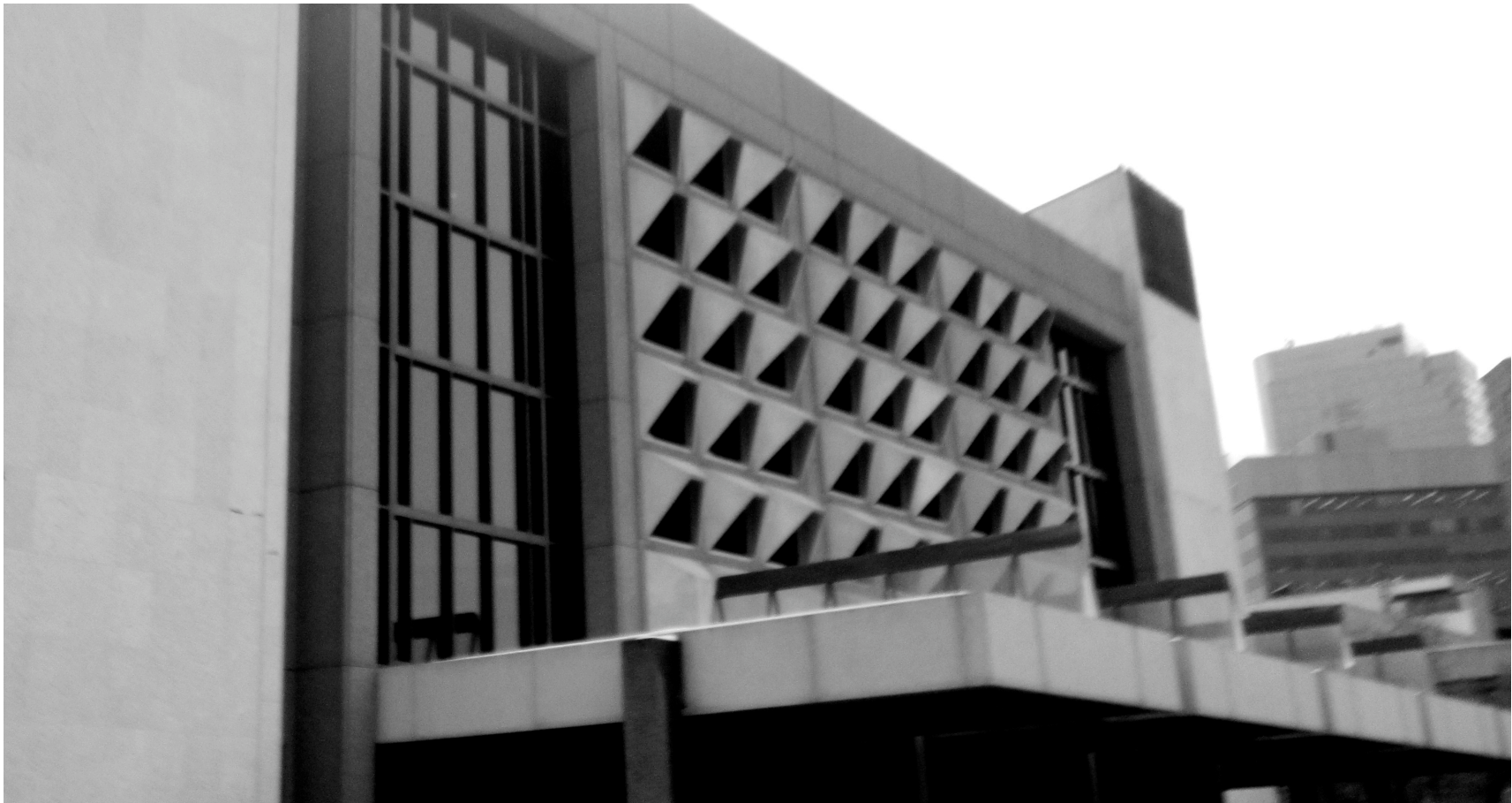
Centennial Concert Hall, Associated Architects for the Manitoba Centennial Centre (Green, Blankstein, Russell Associates; Moody, Moore & Partners; Smith, Carter, Searle Associates; 555 Main Street), 1967.

Sun-screening devices form a sort of sub-theme within Winnipeg's 1960s adjacent Civic and Centennial centres. Directly across Main Street from City Hall, the 1967 Centennial Concert Hall by Associated Architects for the Manitoba Centennial Centre (Green, Blankstein, Russell Associates; Moody, Moore & Partners; Smith, Carter, Searle Associates; 555 Main Street) bears a set of forty-five eyelid-like concrete window covers. These sun-shading awnings, with their origami-like folds, are an example of the modernist exploitation of the plastic possibilities of concrete – here by means of linked sections of pre-cast material.