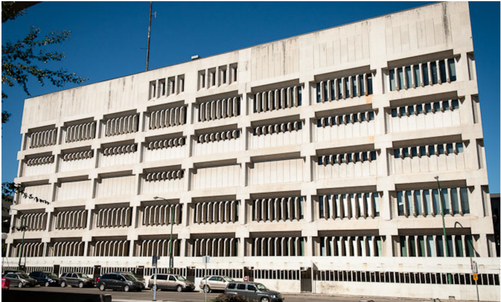
Public Safety Building, Libling Michener and Associates, 1966.

This Civic and Centennial Centre motif continues in the 1966 Public Safety Building (151 Princess Street, by Libling Michener and Associates) which faces City Hall across William Street. Here a type of brise soleil takes the form of heavy, angled Tyndall stone mullions which lend a sense of fortification and solidity to this former police station and jail.