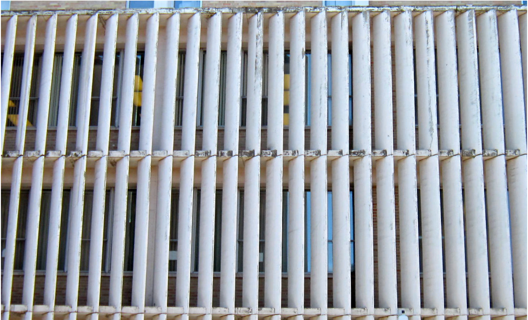
University of Winnipeg Manitoba Hall, Green Blankstein Russell and Associates, 1958-59.

A similar use of brise soleil can be found in Green Blankstein Russell and Associates' Ashdown and Manitoba Halls at the University of Winnipeg (1958-59). Here large, concrete multi-storey panels stand at an angle to the main structure while shading the sunny south-west façade.